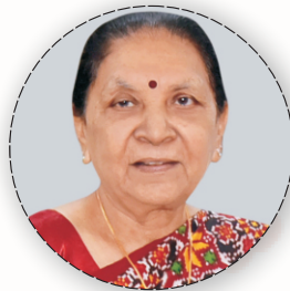
Smt. Anandiben Patel