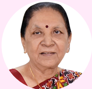
Smt. Anandiben Patel

Hon'ble Governor of U.P. & Chancellor CSJM University Kanpur