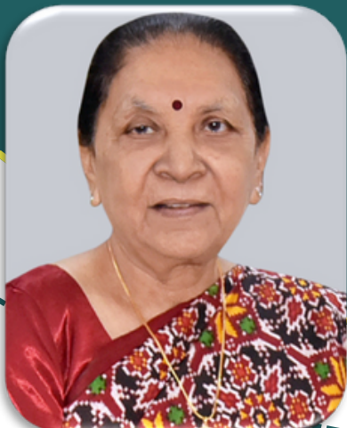
SOURCE OF INSPIRATION Smt. Anandiben Patel Hon'ble Chancellor & Governor, Uttar Pradesh