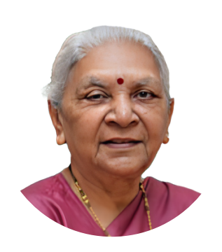
Smt. Anandiben Patel Hon'ble Chancellor and Governor Uttar Pradesh