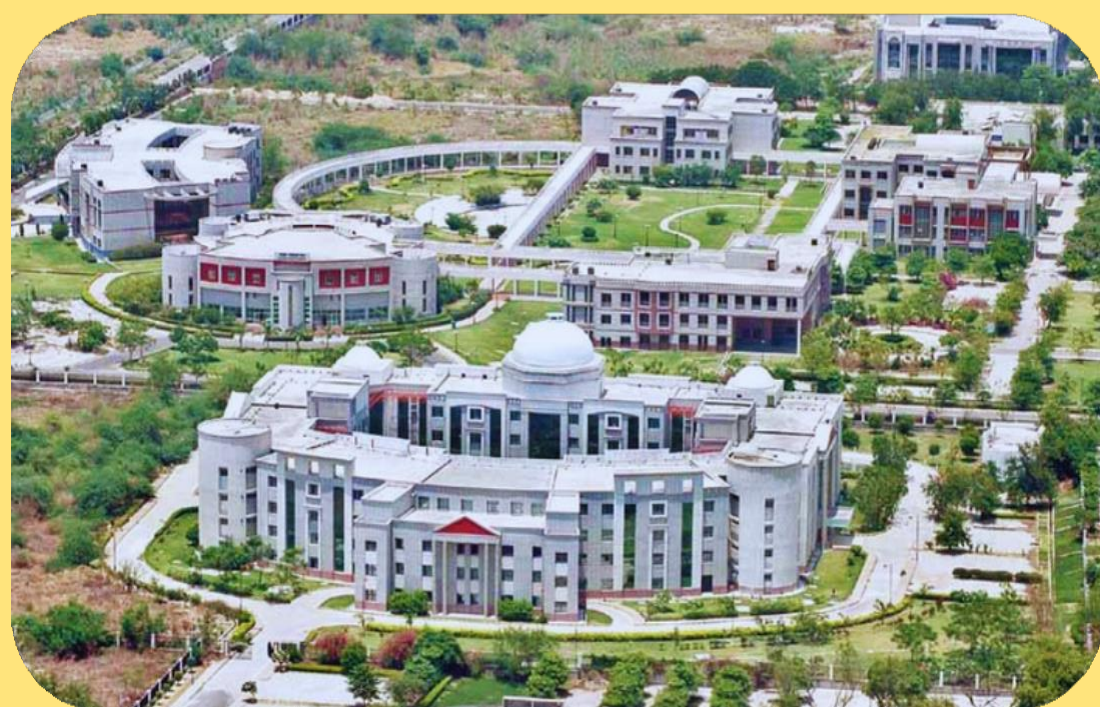
CSJM University Kanpur, UP, India