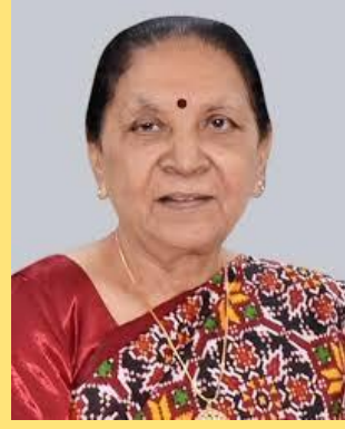
Smt Anandiben Patel Hon'ble Governor, Uttar Pradesh