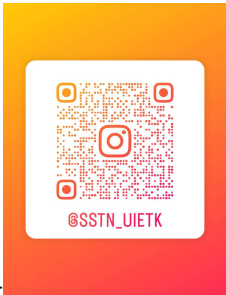
More on -----