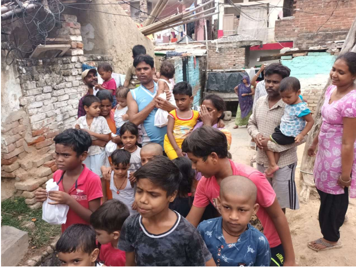
SPECIAL THANKS TO ALL THE VOLENTIERS-----