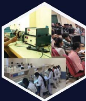
State of the art Laboratories