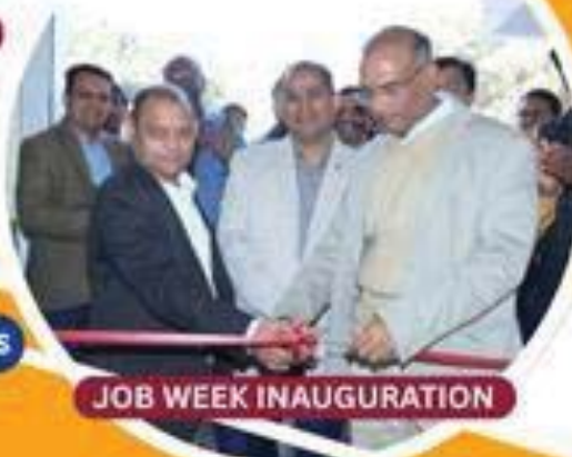
JOB WEEK INAUGURATION