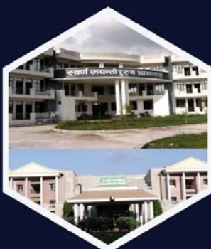
Hostels for boys and girls