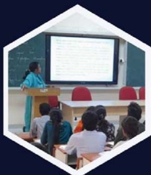
ICT enabled Classrooms