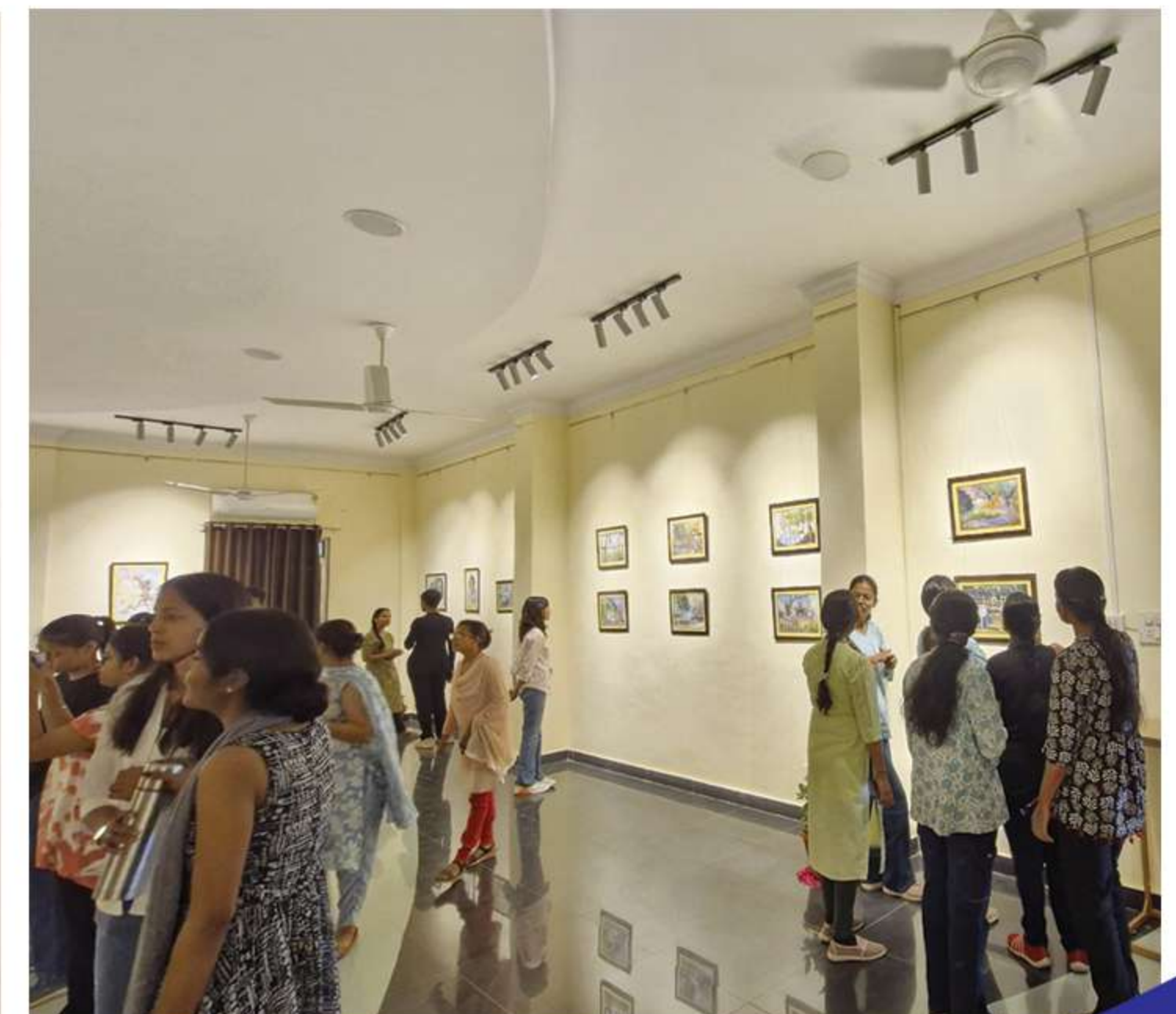
DIFFERENT EXHIBITION IN OUR GALLERY