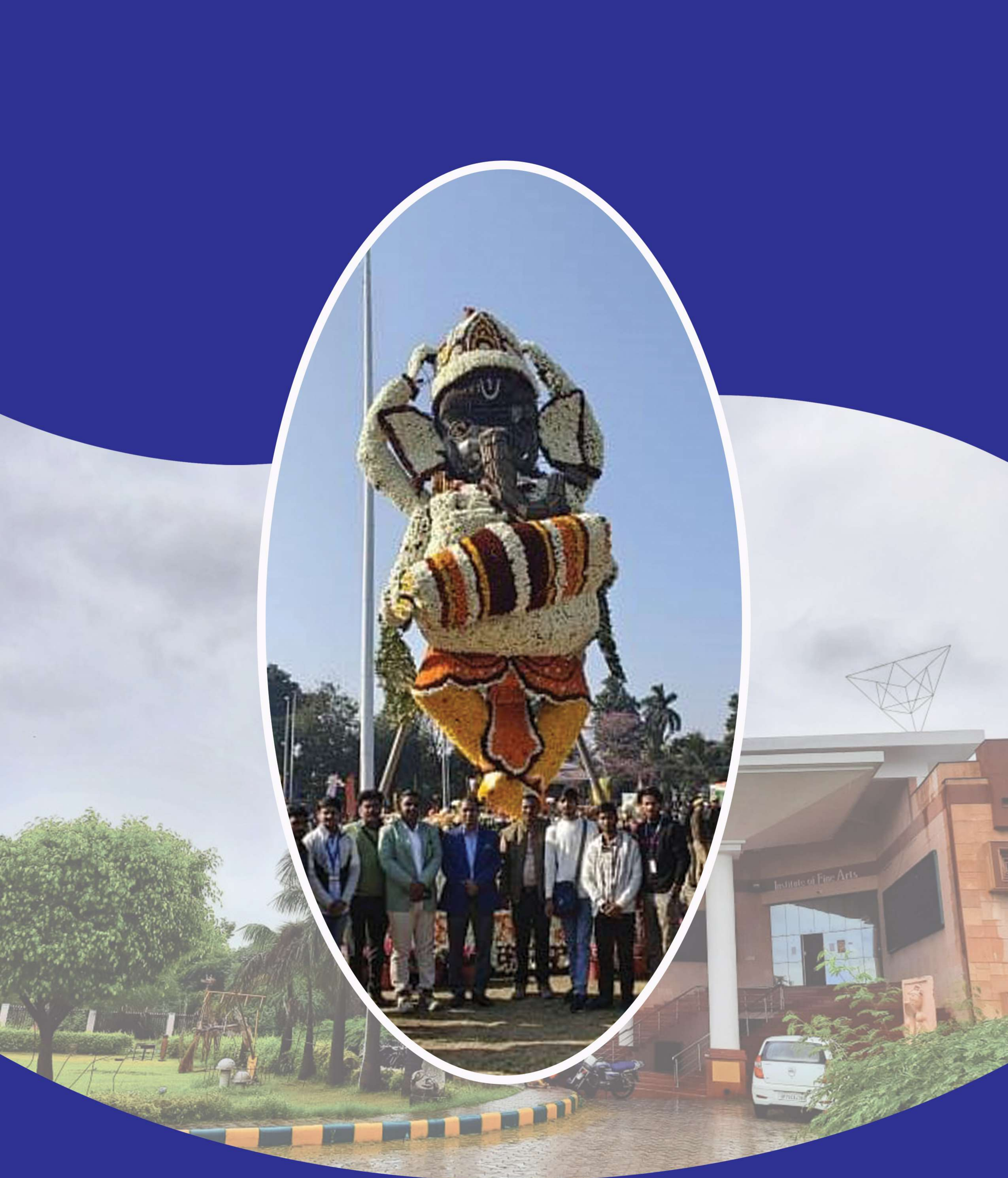
"GANESHA" MADE FROM SCRAP, AWARDED BY THE UP GOVERNOR IN FLOWER EXHIBITION , LUCKNOW.