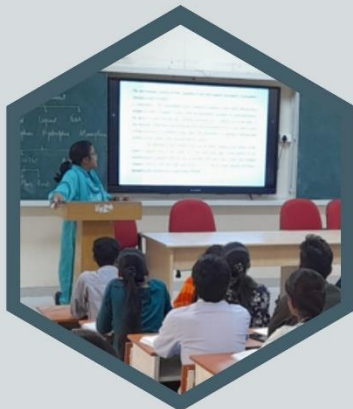
ICT enabled Classrooms