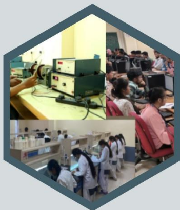
State of the art Laboratories