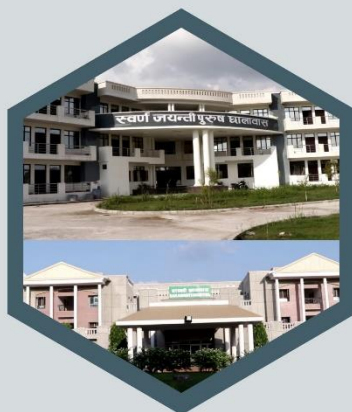
Hostels for boys and girls